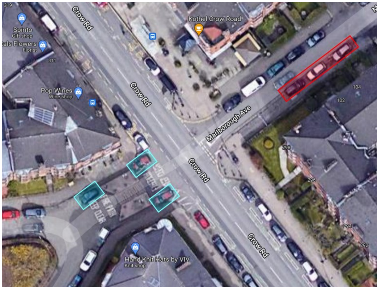
Junction of Marlborough Avenue and Crow Road. Highlighted in red, parking on double yellow lines. Highlighted in blue, the cars blocking the fire path and cycle lane

Long standing issue of parking at the intersection of Crow Road and Marlborough Avenue. There is constant blocking of the cycle lane and fire path at one side and the blocking of the pavement on the other.