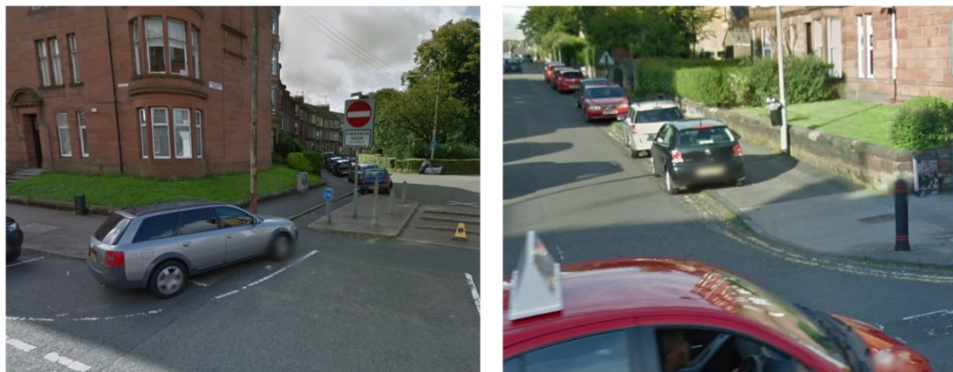
Same areas a decade ago. Images from 2012 google street view

The street design is not fit for purpose to ensure these areas remain clear of parked cars and a decade of the problem shows enforcement is also not adequate.