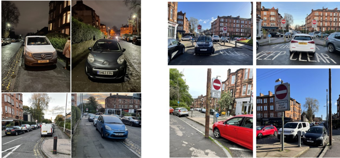
Recent pictures of (left) Cars blocking the pavement and parking on double yellow lines. (right) Cars blocking fire path and cycle lanes.

The issues have been occurring for at least a decade - I have attached images from google street view in 2012 which show the same issues occurring.